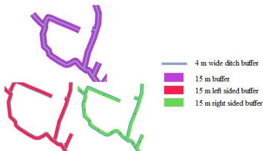
Fig. 1. Example of ditch bank side determination using vector azimuth